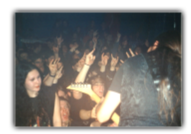
15.3.02 Ljubljana / Slowenia with Agathodaimon