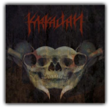
1999 Eternal Black Reflections