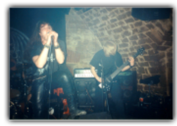
9.4.02 Ulm / Germany with Lord Belial & Satanic Slaughter