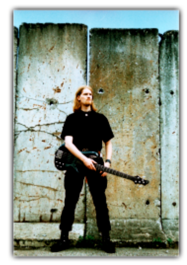
Gruni (bass guitar)