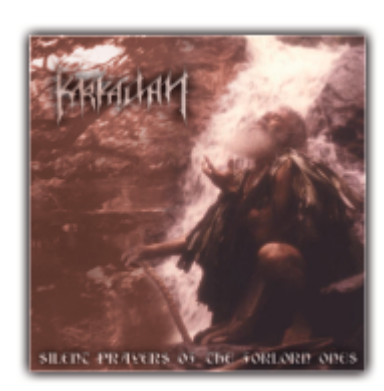
2002/2003 Silent prayers of the forlorn ones