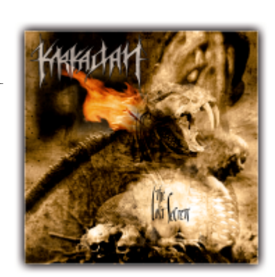
2002 The Lost Secrets